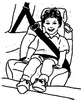
D. Belt-positioning booster seat